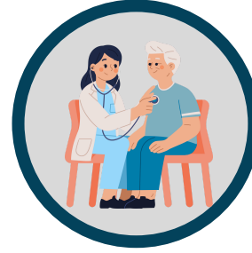
Health Screenings & Assessments