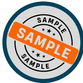
Free Samples & Demonstrations